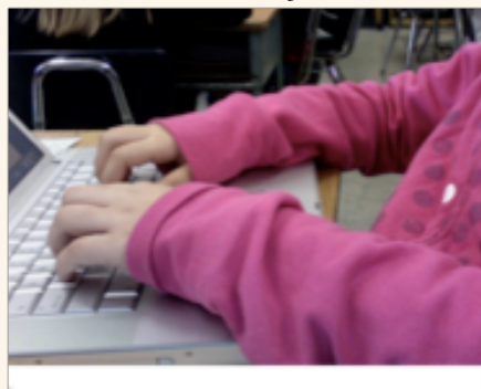
Keyboarding Grades 2-5